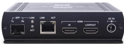
Transceiver Front View